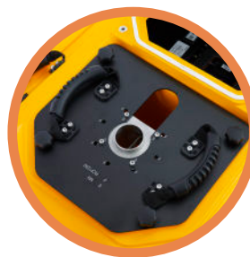
ADCP access shaft