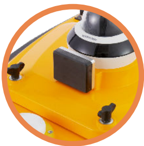
Millimeter wave radar